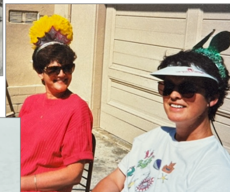
1995 – all dolled up for a garage sale.